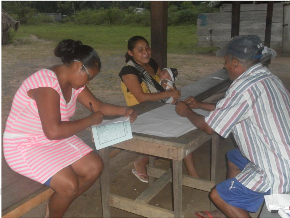
Meeting with members of Kangaruma Village